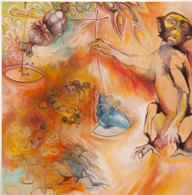
Fire Ants • Acrylic and oil on canvas 2010

Reoccurring images such as boats, birds and cloven hoofs assemble in painterly narratives exploring transformative themes of birth, life, death, and renewal.