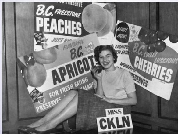
Miss CKLN 1952

As its name suggests, this exhibit looks at the history of radio in Nelson, with a focus on the earlier years of broadcasting when the medium was most popular.