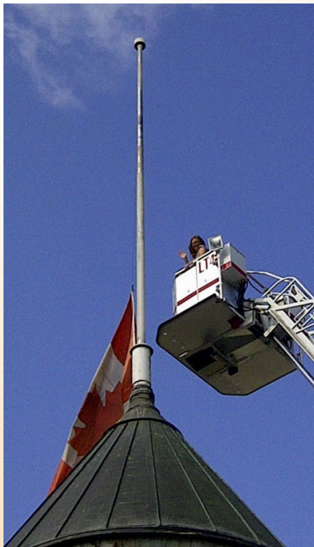
Lending a hand with the annual changing of the flag (summer 2011)

On a smaller scale, we're going to schedule more meetings and work time to better evaluate our activities so that we can constantly be improving